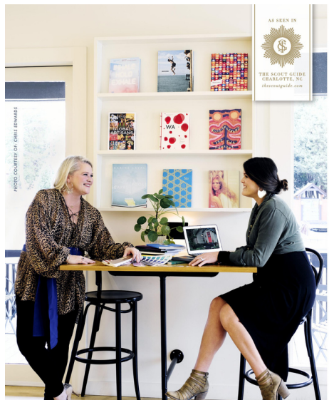
The Scout Guide Editor's Page